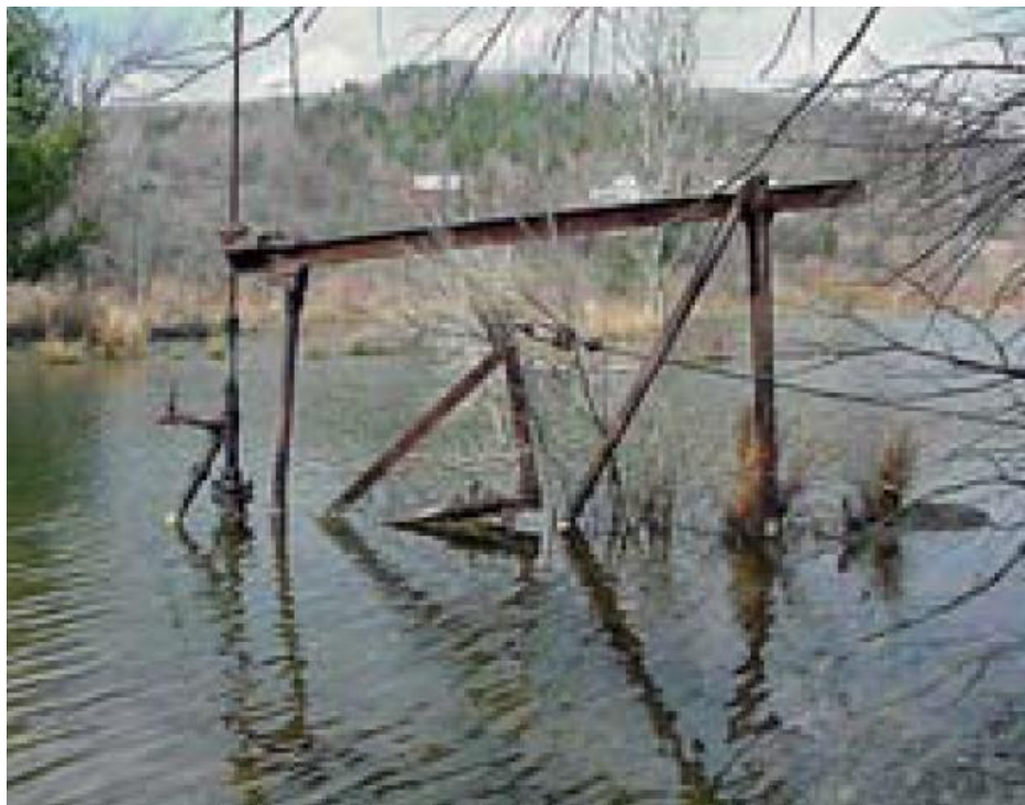
Figure 5: “Old abandoned oil well under water in Town of Bolivar, Allegany County” (15)