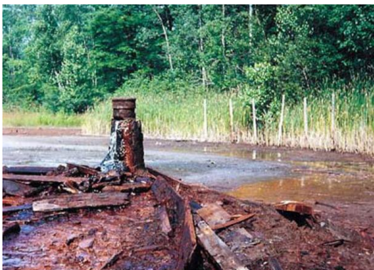
Figure 1: “This Priority Plugging List well in the City of Rome, Oneida County was discharging brine at a rate of five gallons per minute into a wetland adjacent to Brandy Brook and had already killed over an acre of vegetation in 1998.” (14)

What significance does this issue have for anyone? As if to answer this question, the authors of the 2002 and 2003 annual reports (Mineral Resources Division Director Bradley J. Field and his staff) (14, 15) presented case studies of individual abandoned oil and gas wells. Selected cases are re-presented below for illustration.