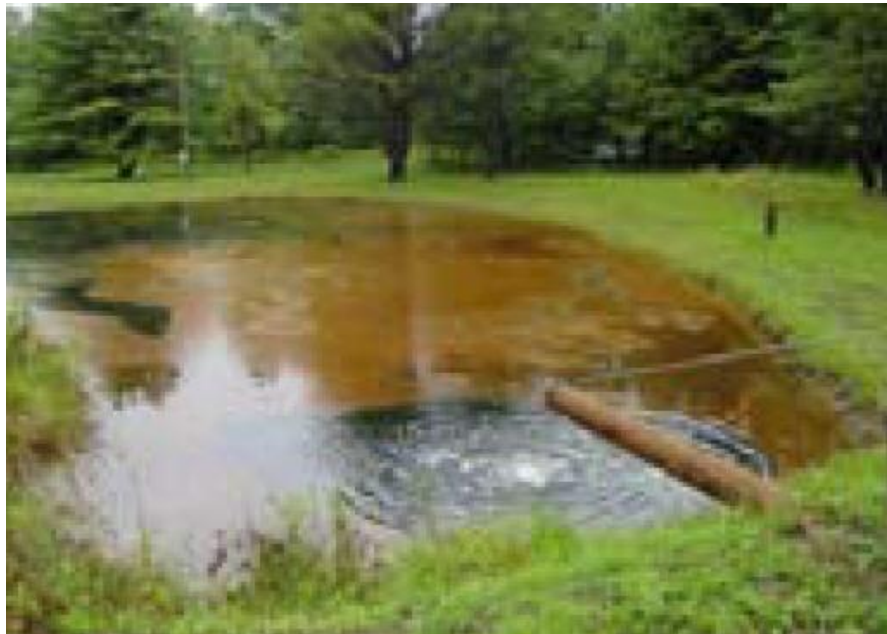
Figure 7: “In 2003 a landowner in Allegany County reported that a leaking well was causing an oil scum on their pond. The party responsible for the wells is an inactive company that has been the subject of pending DEC legal action for over 12 years. This is just one of the company’s hundreds of long-abandoned wells.” (15)