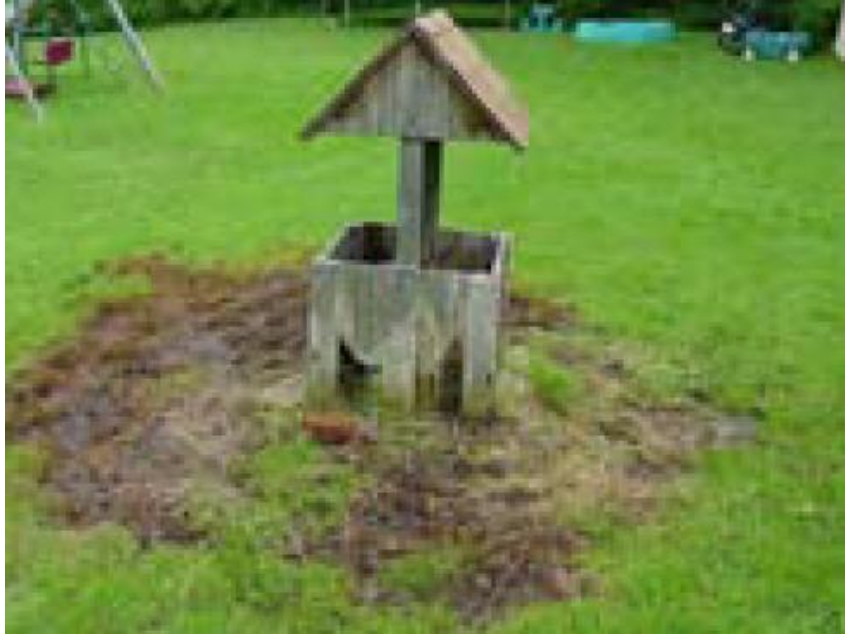
Figure 6: “A landowner in Cattaraugus County complained that a small oil leak in their yard was keeping away potential buyers for their house. An old map shows the well to be part of a long abandoned lease, but the Department does not know who the responsible party is. (15)