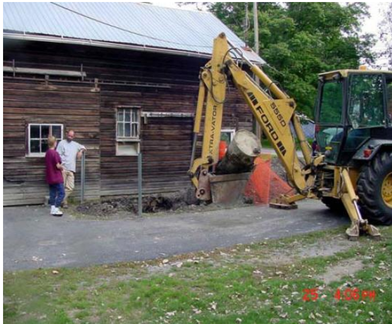
Figure 2: “Pipeline company employees detected natural gas emanating from two residential lawns in the Village of Rushville, Ontario and Yates County. Explosive gas levels were also found inside a garage. Division staff uncovered two natural gas wells in the vicinity. Gas in the soil declined when the wells were vented under DEC direction. Roughly 24 gas wells were drilled in the village in the 1900's and need to be plugged when funds are available. The backhoe is excavating a leaking well next to a building.” (14)