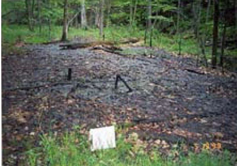
Figure 4: “Town of West Union, Steuben County ... abandoned well near creek leaking crude oil to water” (15)